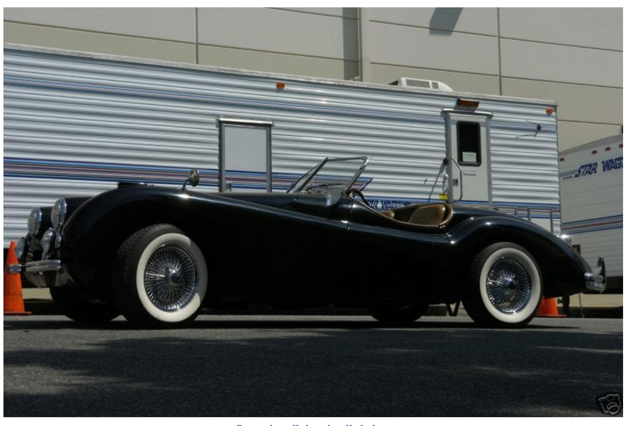
Supersize all thumbnails below